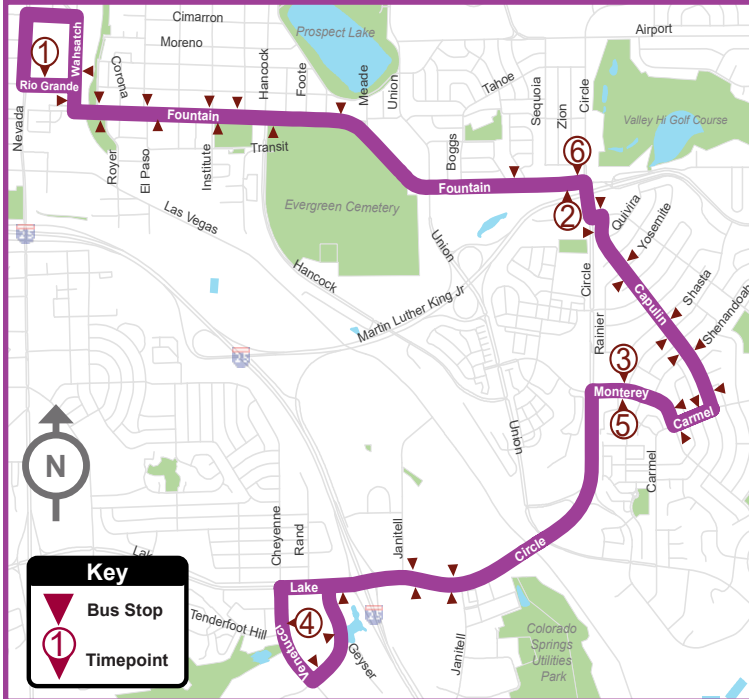
Numbers on map correspond to numbers on schedules.