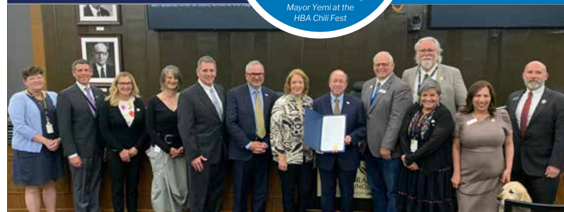
City Council honored former Mayor John Suthers with a resolution of appreciation during their May 9th City Council Meeting