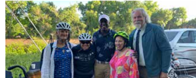
Mayor Yemi and Councilmembers Henjum, Talarico, Avila, and Leinweber enjoying their morning during the Annual Bike to Work Day in June