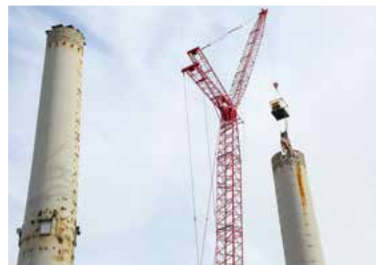
A crane systematically demolishing one of the stacks at the Drake Power Plant