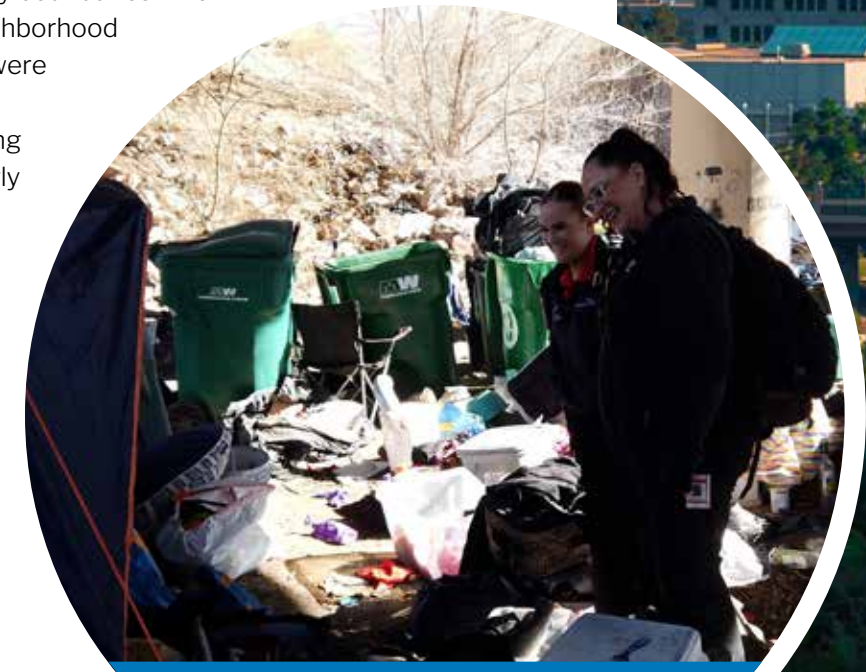
Colorado Springs Fire Department Homeless Outreach Program (HOP) Team helping the homeless community in Colorado Springs

After debate and consideration of amendments, the Resolution passed on a 8-0 vote.