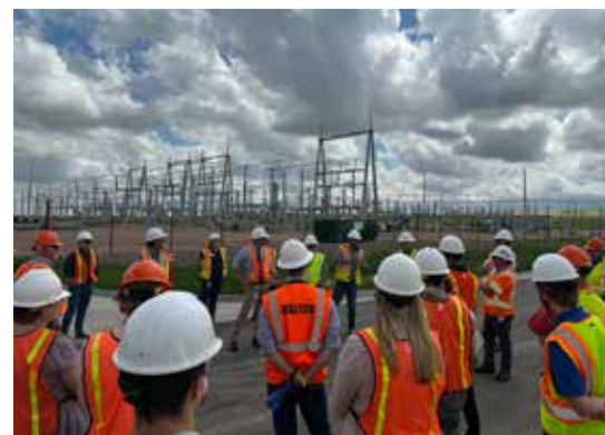
A group of Utilities Board Members and Springs Utilities employees during an Energy System Tour in June