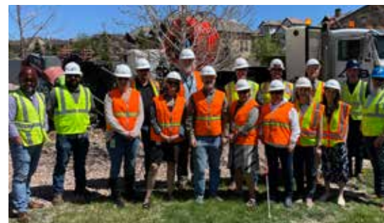
In May, Utilities Board Members and staff visited a project location where fiber optic conduit was installed in Colorado Springs

The reservoir, as well as some nearby trails, will remain closed to the public for safety reasons. The reservoir is expected to reopen to the public in 2026.