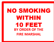
Figure 3 No smoking sign example