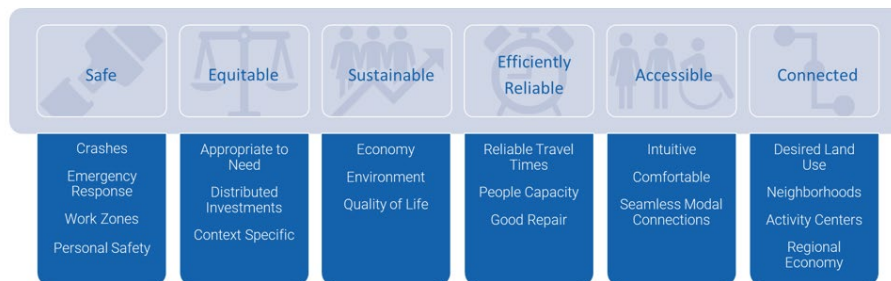
Figure 1: The ConnectCOS Six Goal Framework

Ted Ritschard (Olsson) provided attendees a brief review of project development and public input. Much of the information shared was a review of information included in previous meetings. Ted provided a recap of the six-goal framework (Figure 1) that was established with input from the CAC and continues to guide the technical process and project analysis.